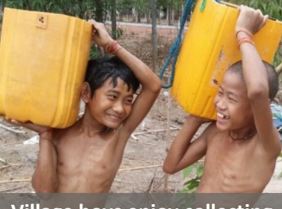
Village boys enjoy collecting water from the new well

Or make a donation securely online: Go to www.faith2share.net/donate and make your gift via NowDonate. Thank you!