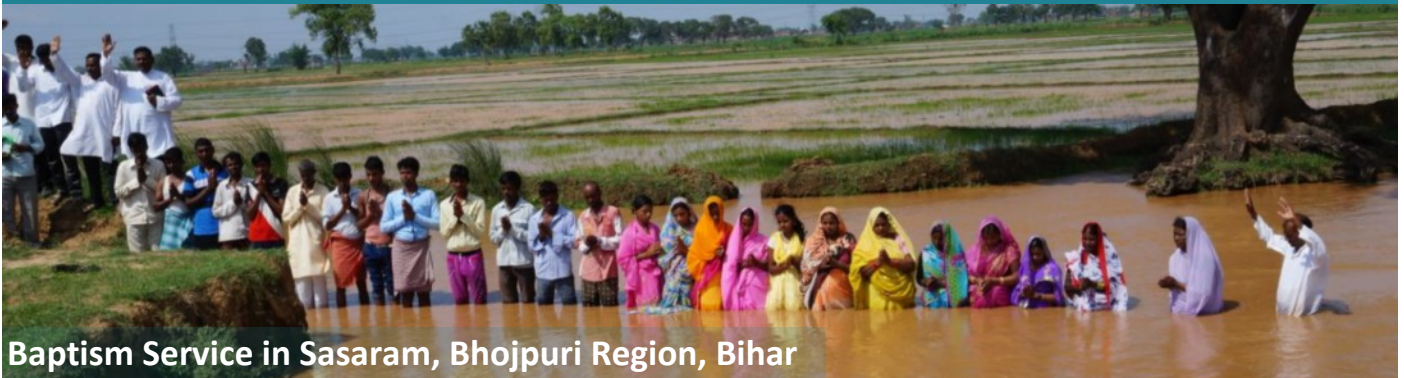
Baptism Service in Sasaram, Bhojpuri Region, Bihar

The gospel is bearing fruit in Bihar, North India and the numbers are staggering. Faith2Share member BORN (Bihar Outreach Network) reports that more than 30,000 people became disciples of Christ last year and 1,162 new villages were reached with the gospel.