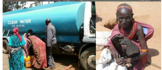
Providing Clean Water