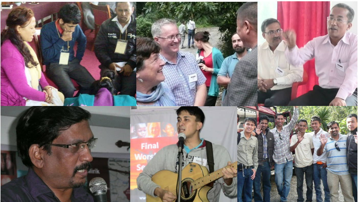
Pictures from Depth Discipleship Consultations in North India and Nepal

Sharing our vision! We'd love to speak at your church. Interested? Email f2s@faith2share.net