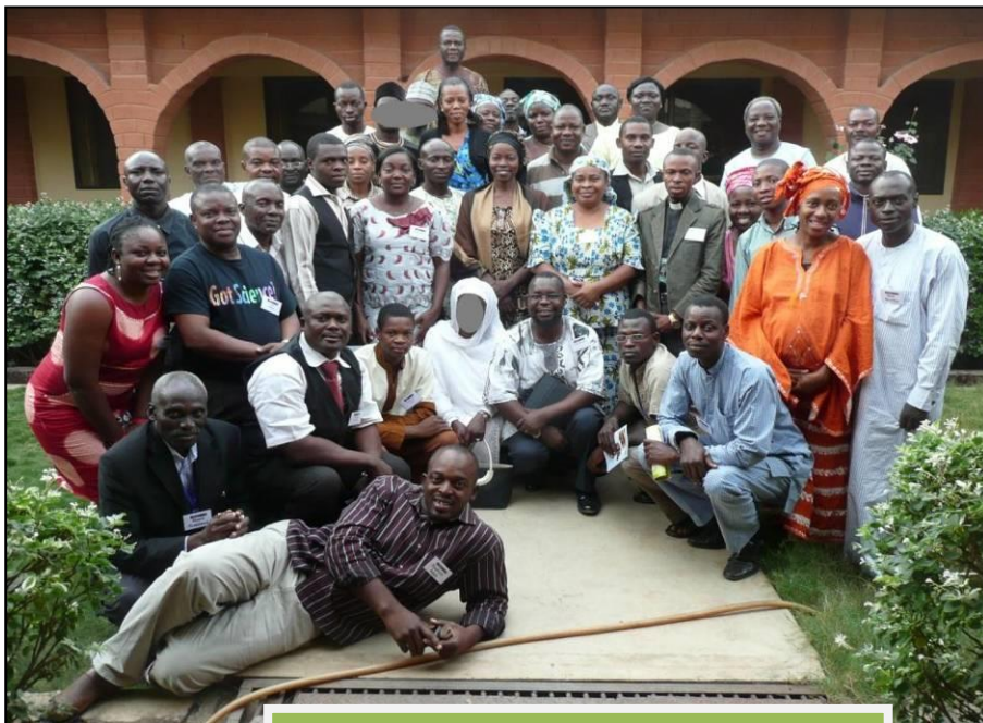
Note: Three faces obscured for security reasons

Ghana, Togo, Chad, Niger and Cameroon, many undertaking long journeys to reach Jos. (Those from Cameroon spent three days on the road in each direction.) One lesson we had learnt from our first consultation in India was that although women in most cultures play a leading role in day-to-day discipleship, especially among children and other women, they are often overlooked and